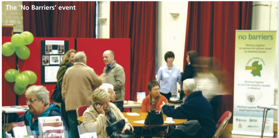
The 'No Barriers' event

On 3rd December, events took place to celebrate International Disability Awareness Day. We joined forces with North Wiltshire District Council, Care and Repair, Citizens Advice, the Independent Living Centre and other groups to hold an awareness and information day at the Neeld Hall in Chippenham. About 50 people